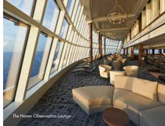
The Haven Observation Lounge