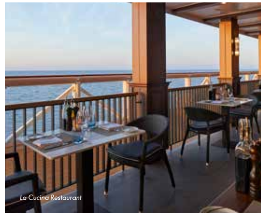
La Cucina Restaurant