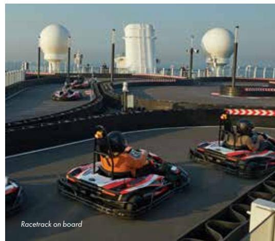
Racetrack on board