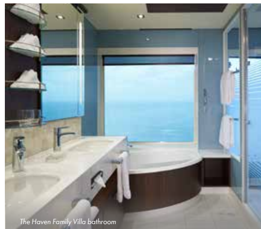
The Haven Family Villa bathroom